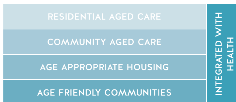
Figure 1: 'Four Planks' or planning elements for positive ageing in the community