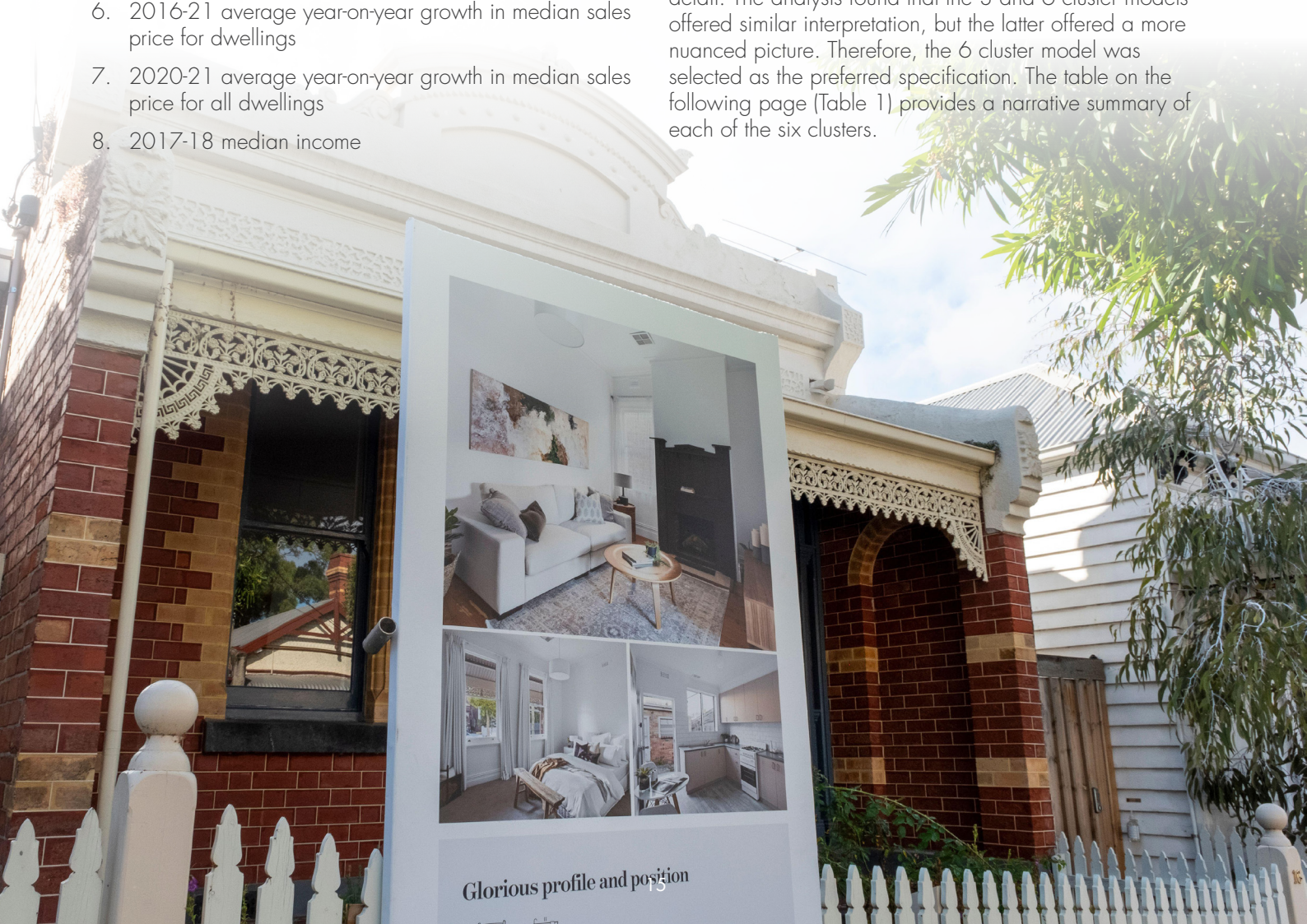
Glorious profile and position

The analysis used statistical techniques to identify discrete clusters of LGAs with similar mixes of these 15 variables. Candidate models of 2, 3 and 6 clusters were shortlisted, and then the results for each model examined in greater detail. The analysis found that the 3 and 6 cluster models offered similar interpretation, but the latter offered a more nuanced picture. Therefore, the 6 cluster model was selected as the preferred specification. The table on the following page (Table 1) provides a narrative summary of each of the six clusters.