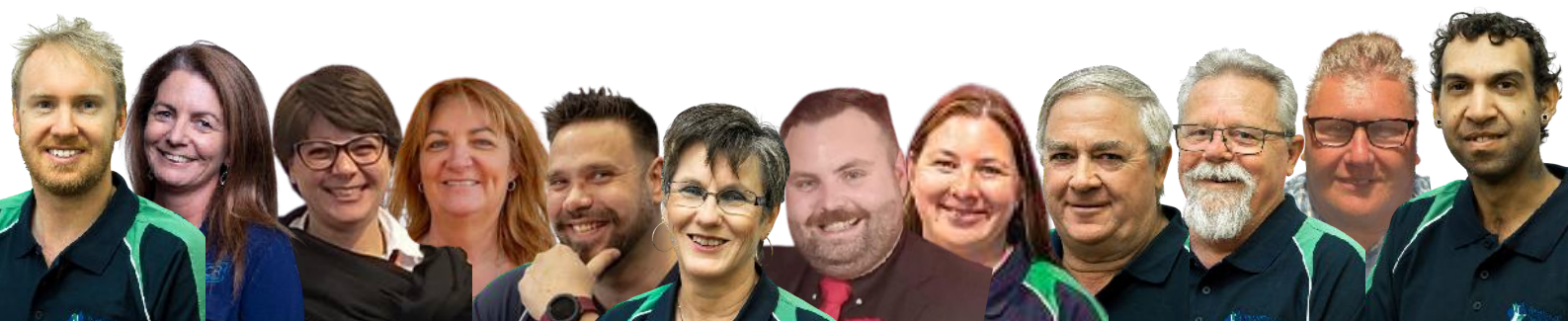
RDA Goldfields Esperance Committee and Staff